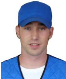
L. Evaporative Baseball Cap