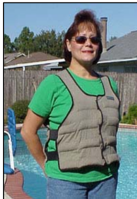
Kit D. Body Cooler – Evaporative