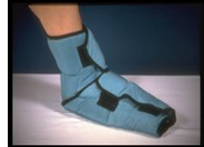
K. Evaporative Foot Wrap