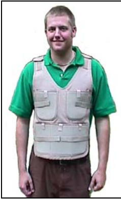
Kit A. Polar Poncho Style – Ice packs