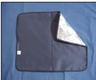
O. Seat Cool Pad