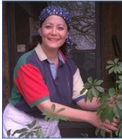
I. Evaporative Head Cover