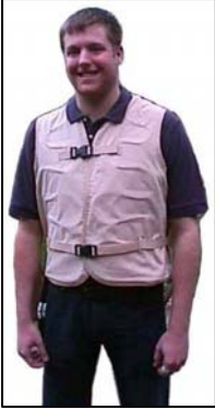
R. Polar Therapy Vest