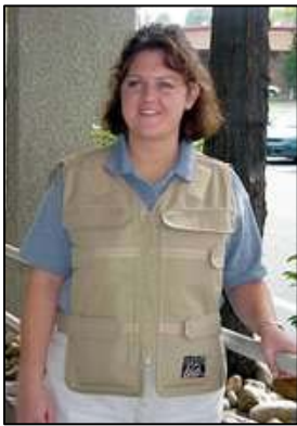
Kit C. Steele Zipper Style – Ice packs