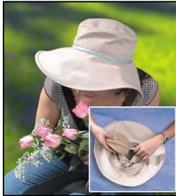
M. Evaporative Garden Hat