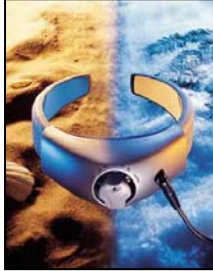
G. Sharper Image Collar